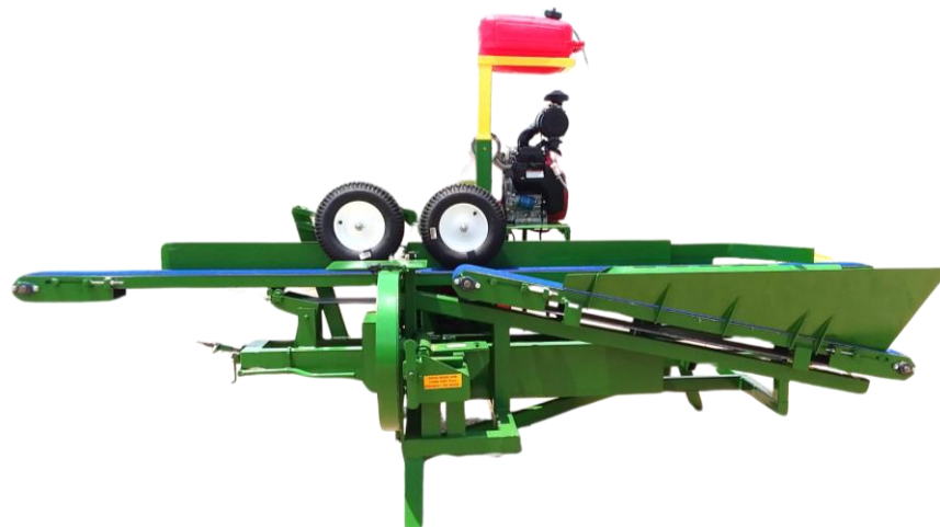
Single Head Gas With Return