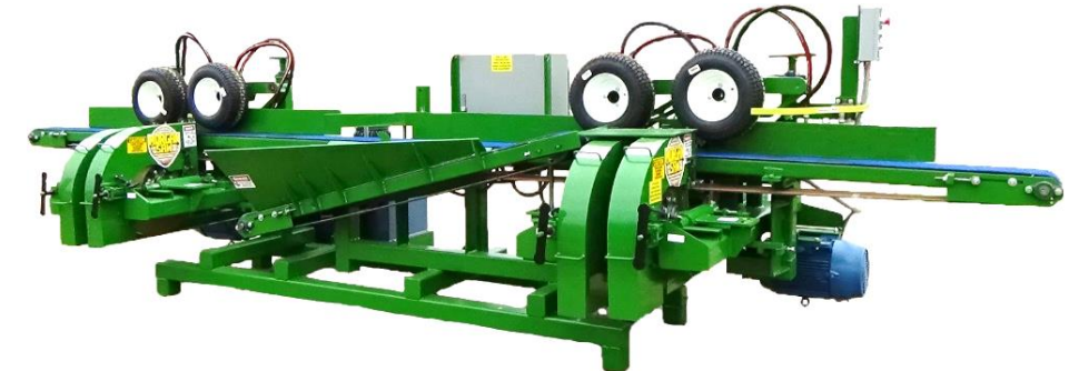
Four Head Electric With Return