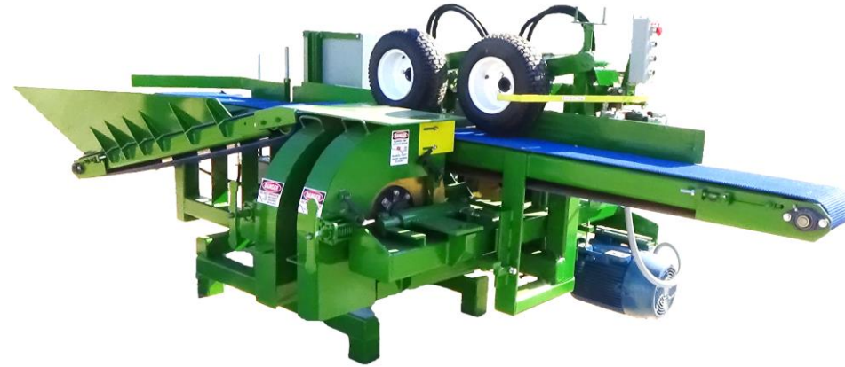
Double Head Electric With Return

Standard models can cut up to 8" wide. Can be custom built to fit your size requirements.